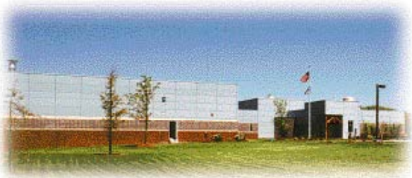
Wood Education and Resource Center

The area's quality stands of hardwoods make the county an attractive location for primary processors and secondary manufacturers of wood products. A U.S. Forest Services Laboratory and the Wood Education and Resource Center, located near Princeton, provide assistance in hardwood research, utilization and marketing.