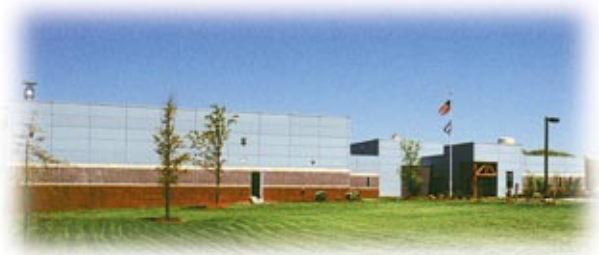
Wood Education and Resource Center

The area's quality stands of hardwoods make the county an attractive location for primary processors and secondary manufacturers of wood products. A U.S. Forest Services Laboratory and the Wood Education and Resource Center, located near Princeton, provide assistance in hardwood research, utilization and marketing.